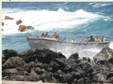
Above -Sightseeing with cameras & farewell to the Orkide group in longboat ready to join Claymore II Left - Narrow entrance to harbor returning between two swells