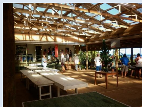
Eligible voters getting ready to vote