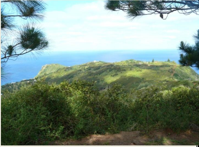
View to Ships Landing Point and Taro Ground from Palwa Valley