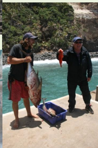
Left - Small shark caught in the harbor did not deter kids from swimming.