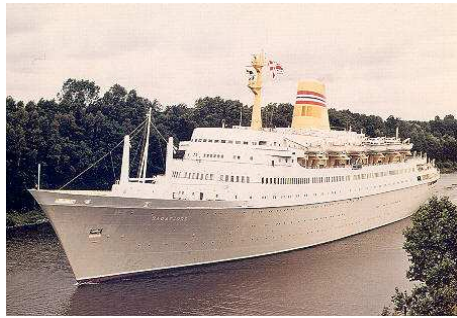
Sagafjord in her original livery going through the Kiel Canal.

When looking back on the many passenger vessels that have visited Pitcairn Island, few (if any) could equal or better the Sagafjord / Saga Rose in the memory of the Pitcairn people of the last several decades. It was the intention last year to give her the first induction, but at the time her fate was not certain (hence, the Remuera became the first inductee vessel). Now, with confirmation from a couple of contacts, the induction of Saga Rose into the “Dem Tull” Hall of Fame can proceed.