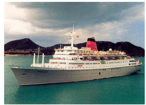
Sagafjord in Cunard colours at Antigua.

In 1980, following a refit, both the Sagafjord and her “little sister” Vistafjord were put under Norwegian American Cruises (owned by Norwegian America Line), although there was little change. However, three years later in 1983 things changed when Norwegian America Line was taken over by Trafalgar House (basically, Cunard). Sagafjord received a small overhaul by having her funnel change to the traditional Cunard colours of Cunard red and black topping, not to mention the Cunard sign on her forward superstructure. However, she retained her name, which she would