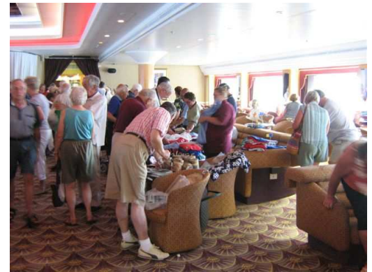
On her final visit, trading was brisk as passengers and Pitcairn Islanders intermingled.

The Saga Rose left on January 9th, 2009 in her 44th and final world cruise. With the completion of this world cruise she would have undertaken more