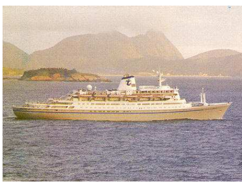
The short-lived Gripsholm era at Guanabara Bay Rio de Janeiro on January 18 th , 1997.

From 1996 until 1997 she was chartered to Transocean Tours for six months. Her funnel was recoloured to fit the company's symbol, and for the first time her name was changed. For the short time she was with Transocean Tours she was called Gripsholm . She did not last long under them, and was damaged by fire. So six months after she began as Gripsholm , she was sold in