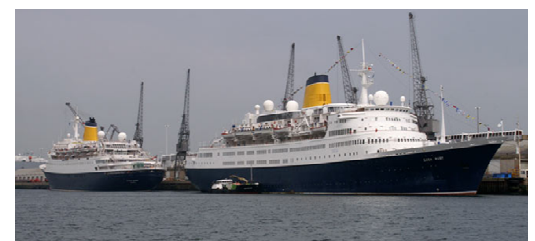
The two sisters, Saga Rose (background) and Saga Ruby (foreground) at the QEII terminal in Southampton on April 26 th 2007.

Once Saga Shipping took over she received her largest change in appearance. She was refitted, and recoloured. While previously she had always sported a light-coloured hull she was now given a deep blue colour, reminiscent of the traditional liner appearance, which flattered the venerable vessel. Her funnel was coloured yellow with a dark topping. Many have argued that this was