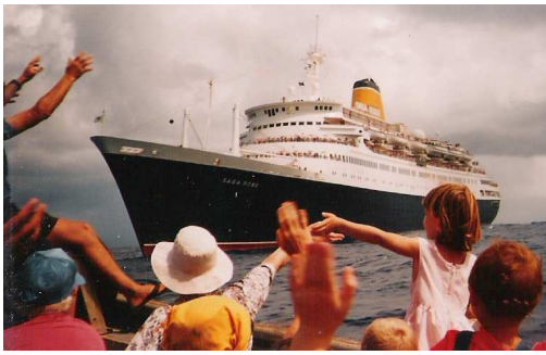
One of the first visits of the ship as Saga Rose sometime after 1997.

perhaps her best appearance in her career. But her greatest change was her name. Discarding the Gripsholm name she partially reverted back to her original identity but with a new twist to it. She was renamed Saga Rose .