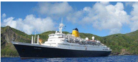
A last, sad farewell to the Sagafjord/ Saga Rose, February 7th, 2009 as she sits just off Pitcairn Island.

world cruises than any other liner (as of 2011), exceeding even that of the QE2. As would be