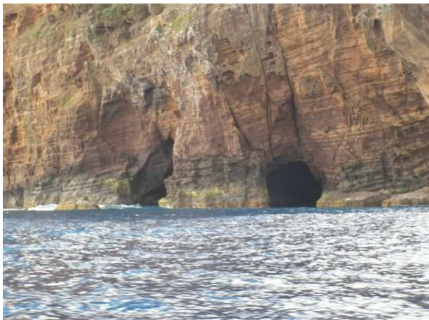
Gudgeon, the huge cave at water level on Pitcairn's southern coast