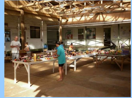
Traditional shareout at the Square after ship’s visit.